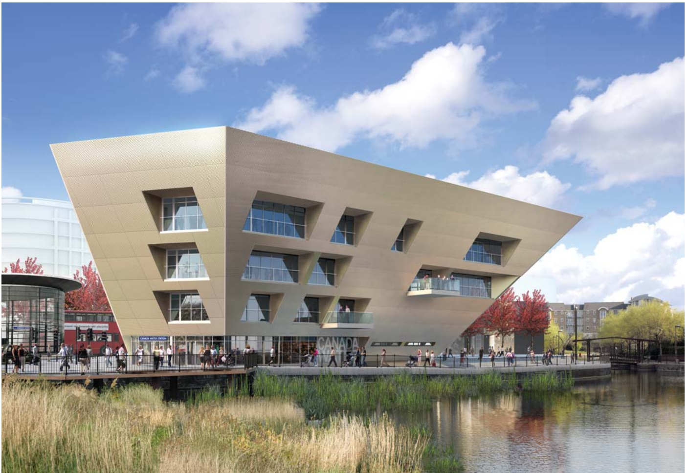
Overlooking Canada Water Basin